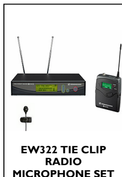
EW322 TIE CLIP RADIO MICROPHONE SET