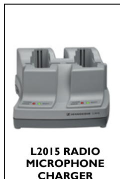
L2015 RADIO MICROPHONE CHARGER