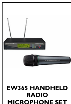
EW365 HANDHELD RADIO MICROPHONE SET