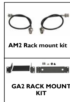
AM2 Rack mount kit